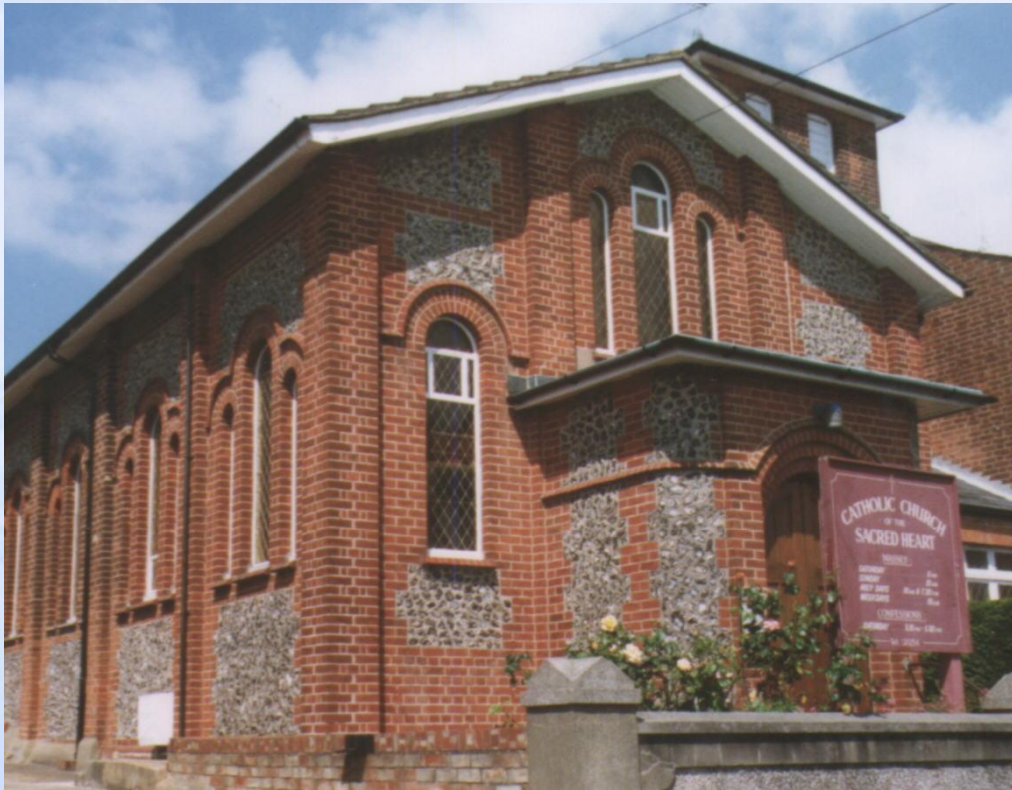
Roman Catholic Sacred Heart, Fort Road (registered for worship 1898)