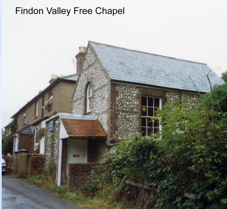
Findon Valley Free Chapel

Baptist, Nepcote (registered for worship 1881) now Free Church