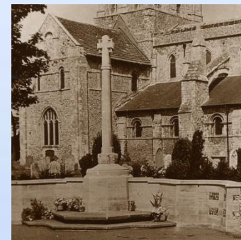
St Mary de Haura & War Memorial