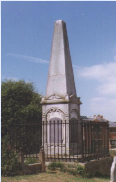
Brazen monument in St Michael's church yard