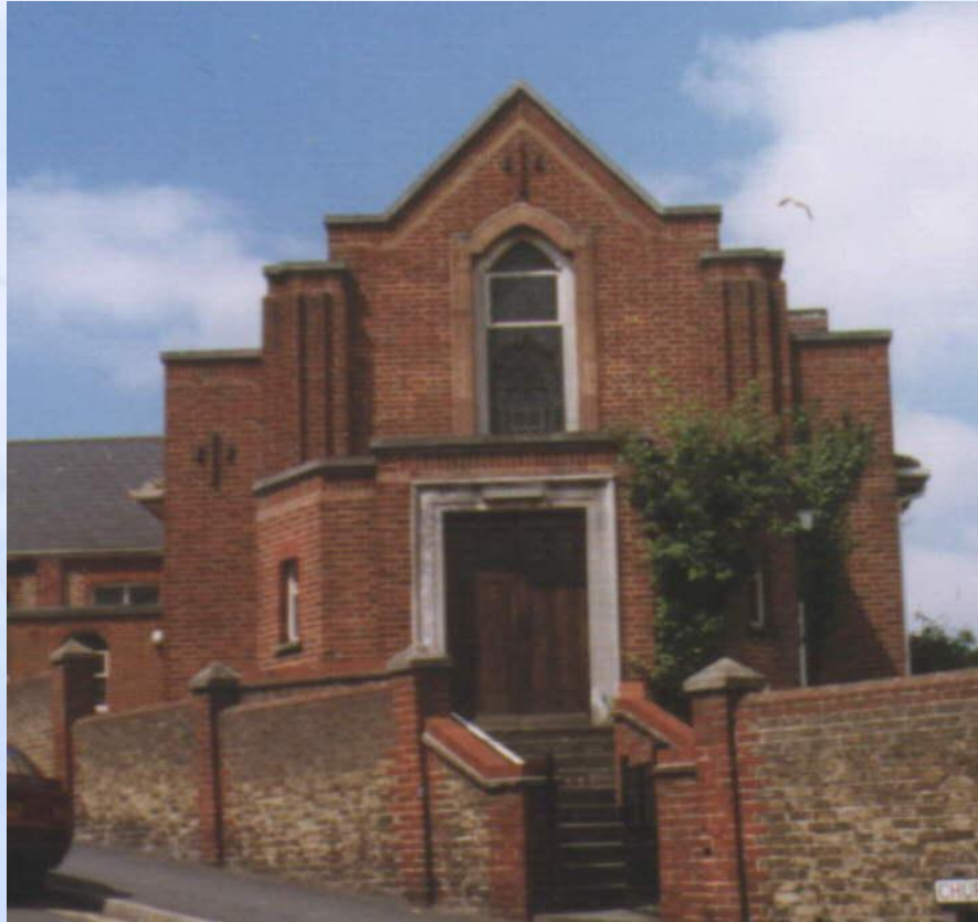
Baptist, Brighton Road (registered for worship 1901) Church Hill