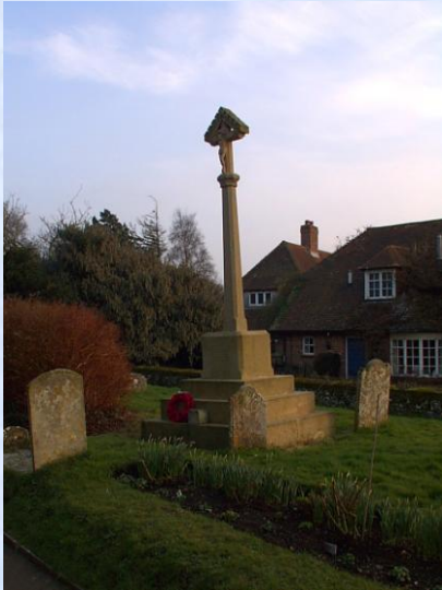
St Stephen & War Memorial