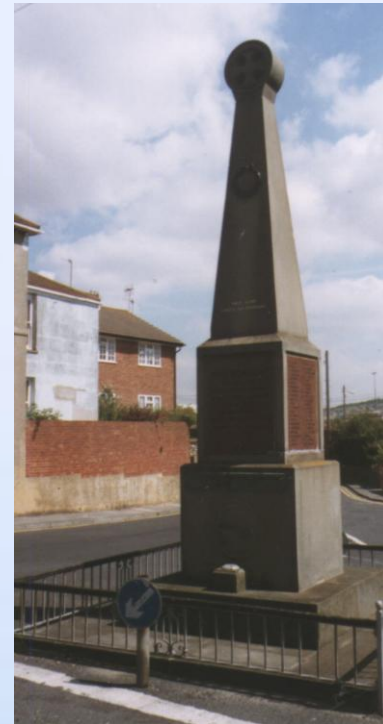
War Memorial in Town Centre