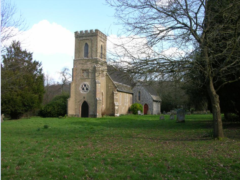
St John the Evangelist & War Memorial