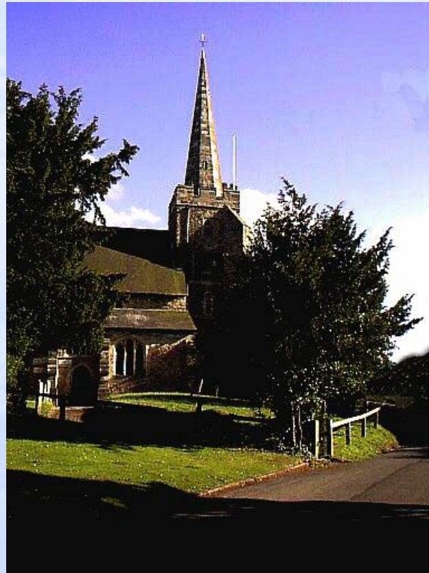
St Mary & War Memorial