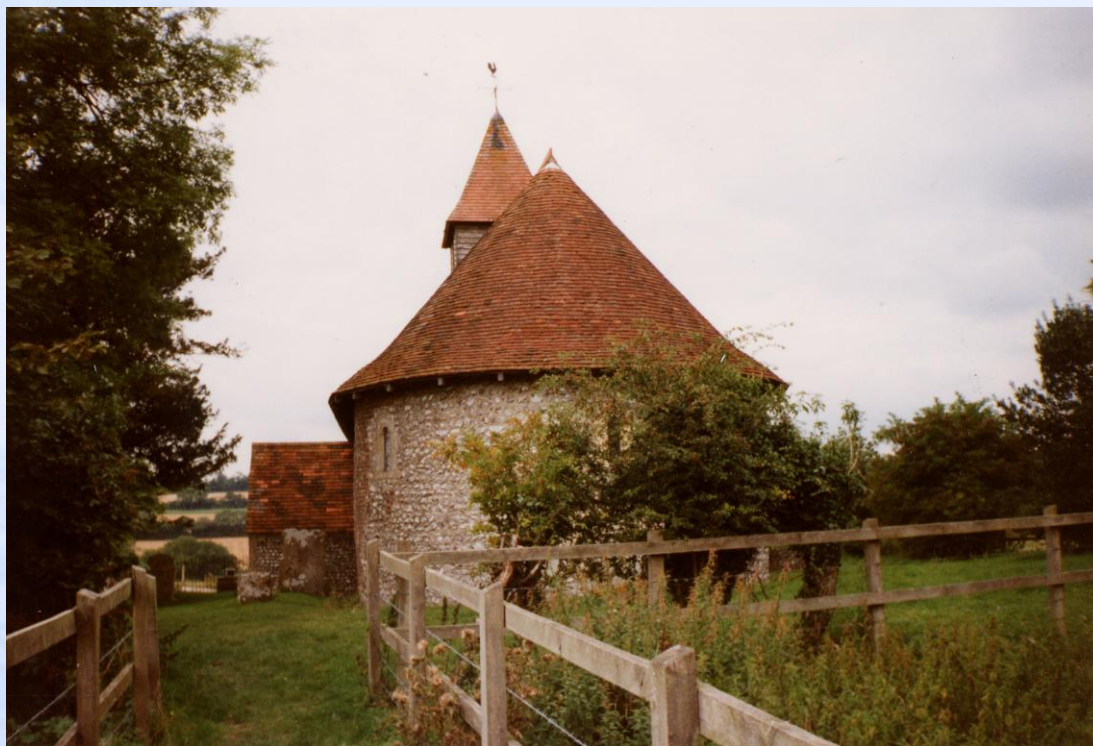
St Mary the Virgin