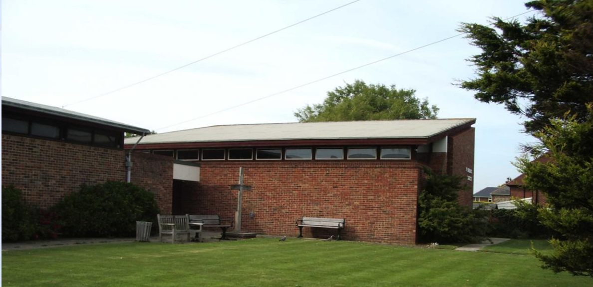
St. Ninian's United Reformed Church,