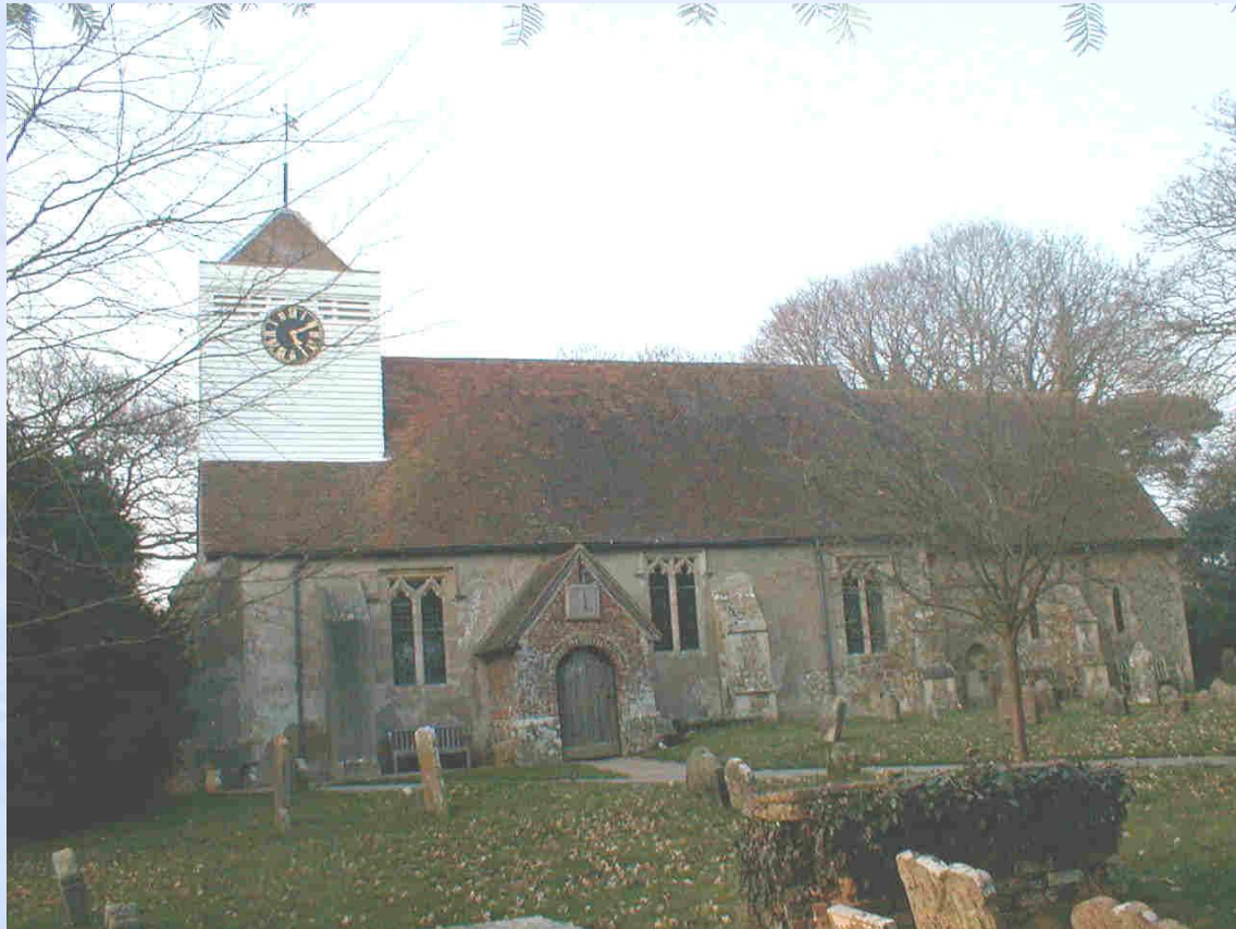
St Mary the Virgin & War Memorial