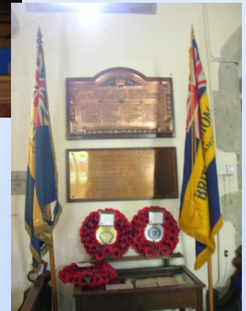
St Mary & War Memorial