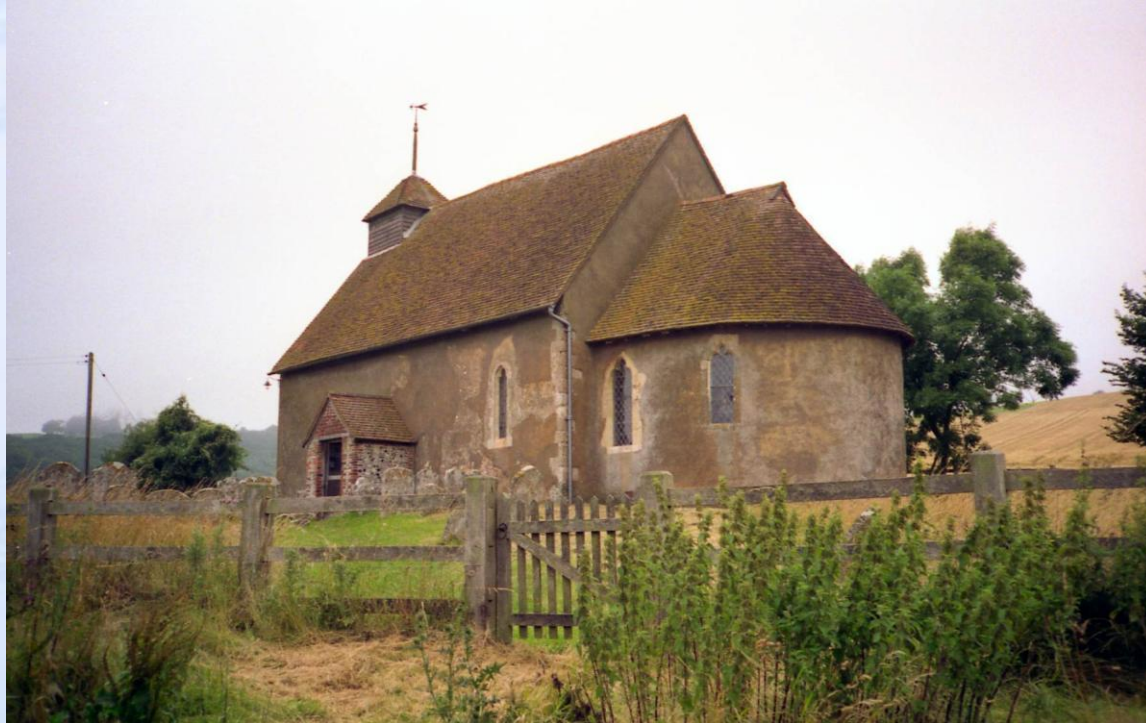
St Mary previously The Ascension