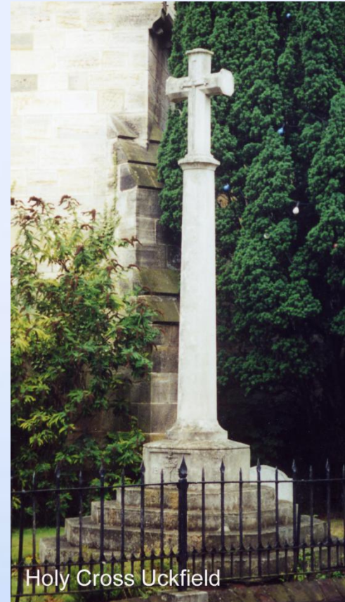
Holy Cross & War Memorial